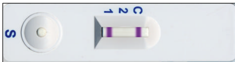
Positive for Genogroup 1