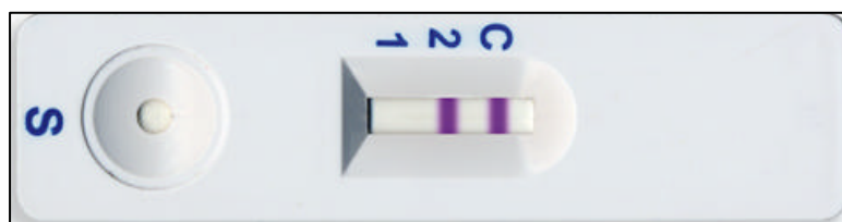
Positive for Genogroup II