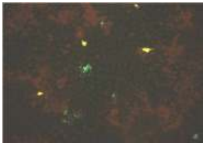
Flu A labelled with R-PE and Para 2 labelled with FITC