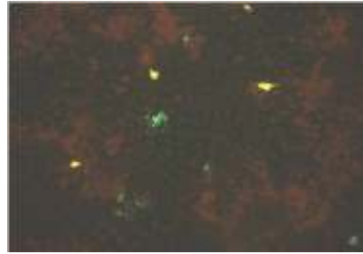
Flu A labelled with R-PE and Para 2 labelled with FITC